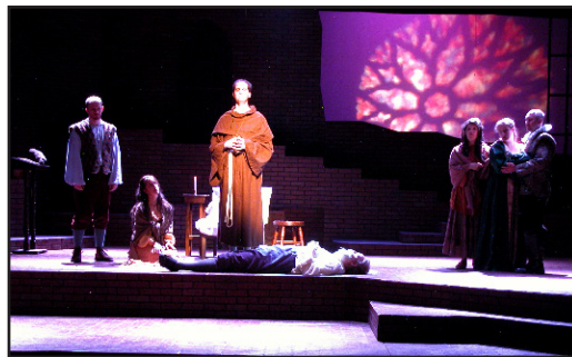
Man of La Mancha production, photos courtesy of Joseph P. Oshry